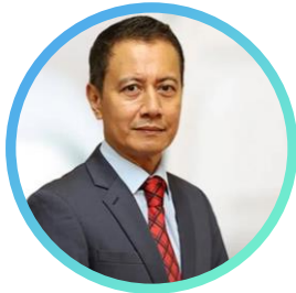
TAN SRI DATUK AZHAR AZIZAN HARUN